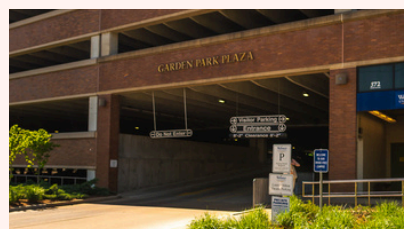
Garden Ave. parking garage