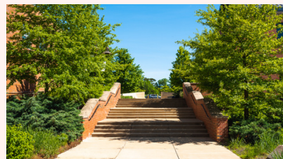
Steps/ramp from garage to west entrance