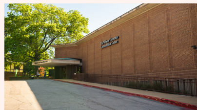
Ride share drop-off/pick-up

Ride-share users may use the semi-circle drive on Edgar Rd (entrance at the corner of Garden Ave and Edgar Rd) for drop-off and pick-up.