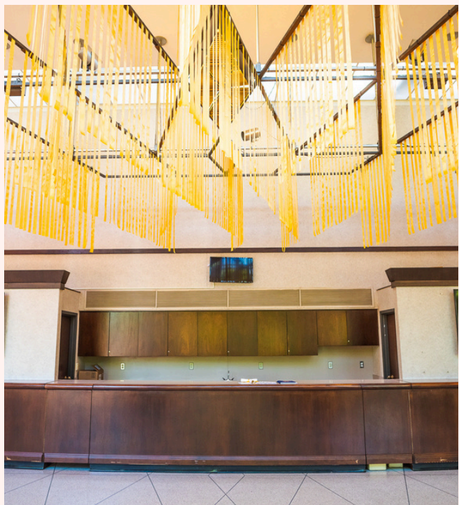
Lobby concession stand