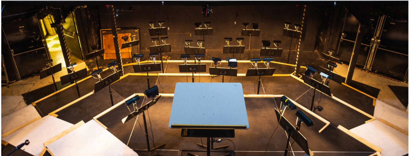
Orchestra pit, located under the stage